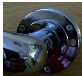
Insert woodscrews and drive home securely