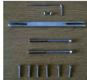
Each set will be supplied with