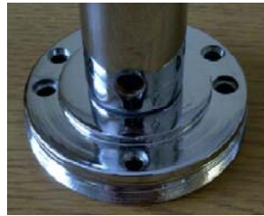
Each rose has 5 holes plus hole in neck of lever