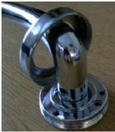
Unscrew the outer roses from each half