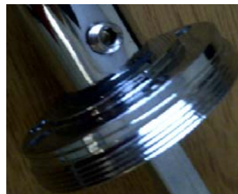
Insert grub screws in holes on underside of neck of lever and screw in using allen key provided.