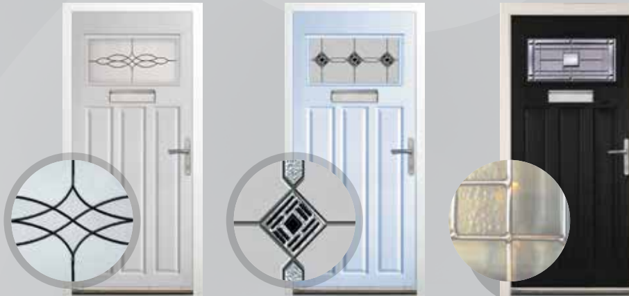
Lutyens with Simplicity Glass

We can offer this door design in a wide range of colours to suit any design scheme.