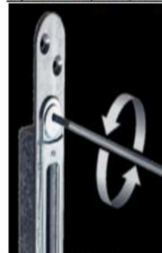
Adjust the strike plates +/-2mm

The bolts should throw into the strike plates centrally.